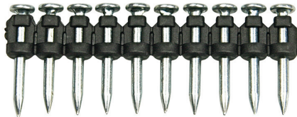
TKA standard nails for gas nailer FORCE ONE