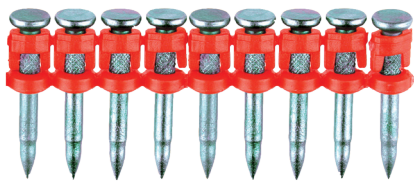
XHA premium nails for gas nailer FORCE ONE